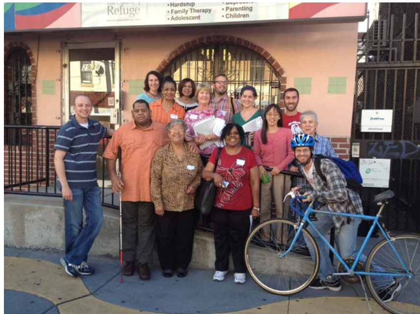
New Song Community Church of Baltimore with Liberti East Church from Fishtown visiting Refuge staff for an all-day Saturday intensive at Refuge on Lay-Counseling Training for Urban Helpers

Additionally, just this year The Place of Refuge has provided professional training of our model to 14 outside agencies, serving hundreds of individuals. We even had a group travel from Baltimore for an all-day in-house training alongside a local church from our area. To see the determination in their eyes and the commitment in the words that came out as we dialogued about what it means to walk alongside someone who is broken and hurting in their church—well, it was one of the most joyful events in the history of Refuge.